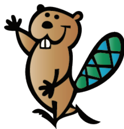
The Beavers of Vilnius