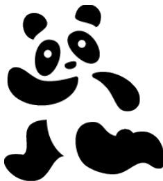
The Pandas of Klaipėda

A Madrich (scout leader) wearing such badge is in charge of this task in the Shevet (Tribe). He/ she will be the reference to answer all questions and help scouts if they need it.