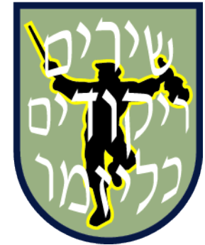
KLEZMER Songs, Dances Klezmer Music