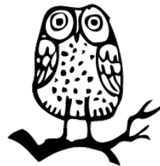
The Owls of Vilnius