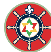
Magen Scout (3rd/4th Year)

Advancement Programme for Scouts and Senior Scouts (12-17 years) in partnership with National Scout Organizations