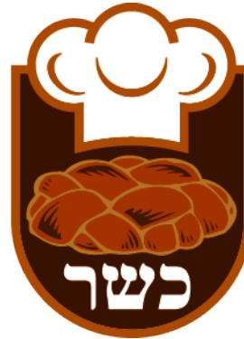
MASTERCHEF Jewish Cuisine