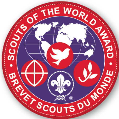
WOSM PROGRAMME in partnership with NSO

"We are the sowers - our children are those who reap. We labor so that future generations will be better and nobler than we are." – Maria Montessori