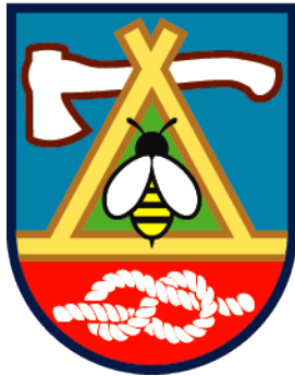
SCOUT TRAPPER in partnership with NSO

"A week of camp life is worth six months of theoretical teaching in the meeting room." – Baden-Powell