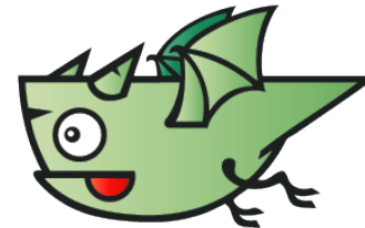
The Green Dragons of Kaunas

Tsofim Yehudim LeDor VaDor, Jewish Scouts from Generation to Generation